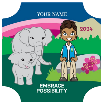
2024 Fall Program Personalized Patch $350+ Total Sales and 18 emails sent