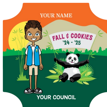
2024 Fall/ 2025 Cookie Crossover Patch 18+ Fall emails sent and Avatar made 250+ Cookie pkg. sold in 2025