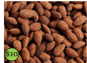
Chocolate Covered Almonds